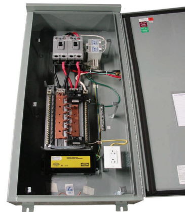
Cell Tower Manual Transfer Panels 200AMP Generator Plug 42 Circuit Load Center and TVSS Unit

Manual Transfer Panels - Under a nation wide contract we currently supply transfer panels from utilities to a portable generator source for cell towers and small convenience stores.